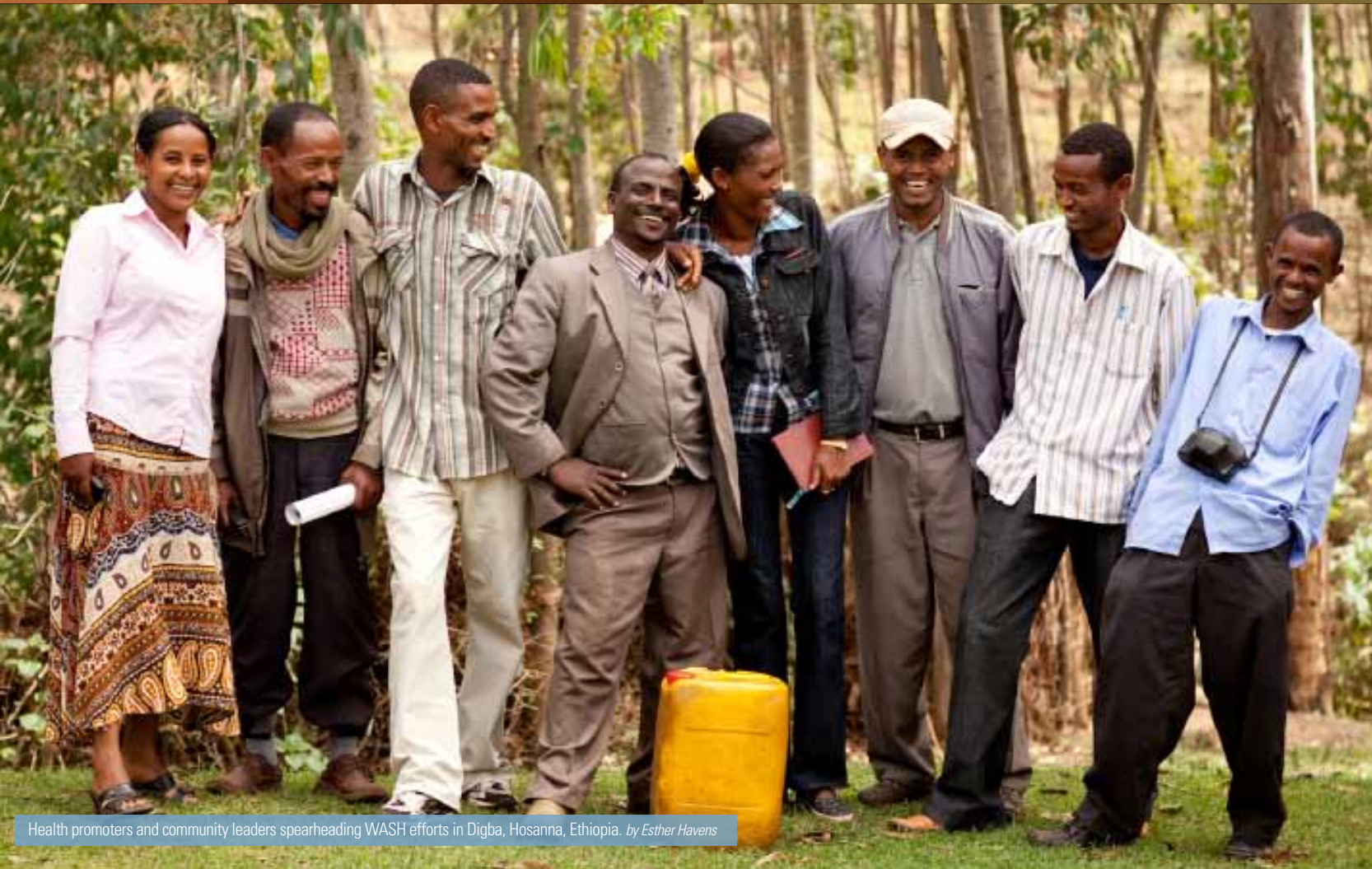
Health promoters and community leaders spearheading WASH efforts in Digba, Hosanna, Ethiopia.