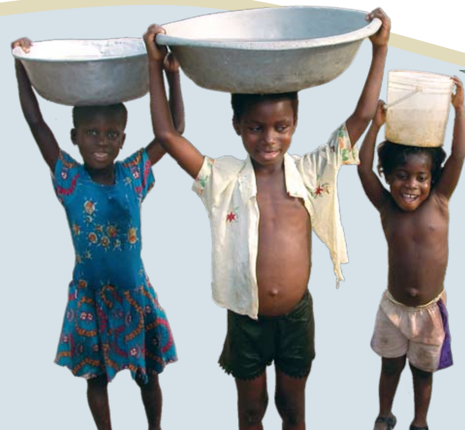
Photo: Children in Lira, Uganda, try out their new village water source.

“When the poor and needy seek water , and there is none, And their tongue is parched with thirst, I the Lord, will answer them; I the God of Israel will not forsake them. I will open rivers on the bare heights, and fountains in the midst of the valleys; I will make the wilderness a pool of water, and the dry land springs of water.” ~ Isaiah 41: 17-18