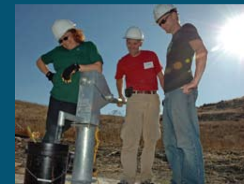
Photo: Field trainers and staff experience the joy of clean water after fixing a Mark II bush pump at the inaugural pump repair training workshop held at the new Lifewater Training Center in San Luis Obispo.