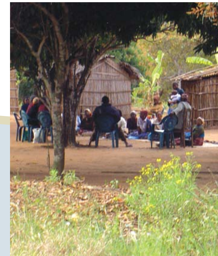
Photo: A women’s group gathers in the Massinga District of Mozambique. Lifewater’s initiative with its Mozambican partner, Agua Para Todos, will tap into already established groups such as this one. Read below for more information on this project.

Instead of material gifts, choose gifts from Lifewater’s online Christmas catalog to honor your friends, family, and business associates. Present your honorees with our attractive holiday gift cards that explain Lifewater’s mission and how the gift you made in their honor will make a difference to families in need.