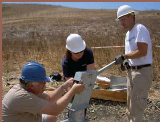
Above: Participants in the inaugural pump repair training workshop held at the new Lifewater Training Center in San Luis Obispo discuss issues related to pump repair in the field.