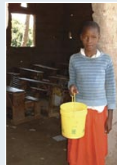
Water or Education? Rising water costs are forcing many schools to shut their doors.

"All you who thirst, come to the water! Though you have no money, come . . ." (Isaiah 55:1)