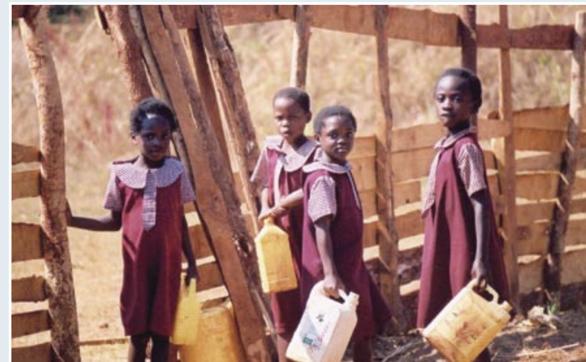
A source of safe water at schools helps increase female enrollment.

People all over the world cite lack of education as one of the main obstacles to reducing poverty. Lifewater understands that in order to improve education, issues like water and sanitation need to be addressed. That is why Lifewater is working to provide schools with safe water, latrines, and hygiene education in places like Zambia, Kenya, Ecuador, and Central Asia. By reducing disease and providing for students' basic needs for water and sanitation, schools once again become assets to the community and catalysts for a better future.