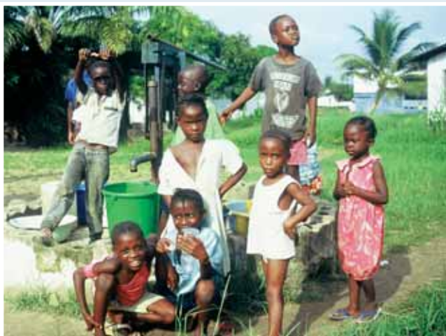
No money, no water. Children can no longer access clean water because the price is too high.

"[Water is] one of the world's great business opportunities. It promises to be to the 21st century what oil was to the 20th." - Fortune Magazine