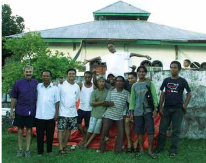
Above: Team Bore in front of the mosque with two Soki community leaders.

While Team Bore was onsite drilling in Soki, one crew member made an astounding confession that he had fought on the side of the Jihad in the area that they were installing the well! Not only that, he recognized several of the community members who had fought with him. God had transformed his life in the refugee camp while receiving training from Lifewater volunteers. He is now working to bring peace and salvation to Muslims as he cares for their need for clean water.