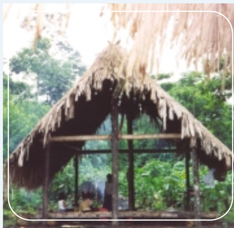
Ancient ways yield to a new way of thinking under the eaves of this kitchen hut.