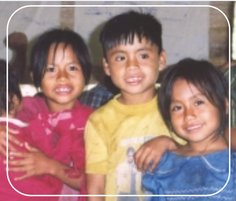
The children of the Shuar tribe loved the hand washing lessons!

Our small plane circled over two-dozen thatched roof buildings in the midst of thick, green jungle, then touched down on the dirt landing strip. On the runway stood a group of young Shuar men and children from the village of Yampuna in southeastern Ecuador. Some had painted their faces with geometric designs using the bright red dye of the annatto seed; they looked both fierce and beautiful.