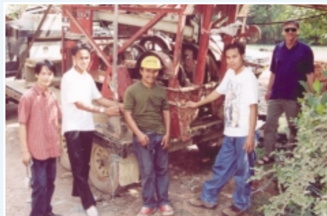
Southeast Asian Lifewater-trained crew next to their cable rig, which they will be using to begin their business and ministry.

a Lifewater-trained well drilling crew has developed a plan for operating a Christ-centered well drilling and pump repair business. Their goal is to become completely self-supporting. They will be drilling wells for poor villages at a discounted price, subsidized by profits earned from drilling wells for commercial interests. Lifewater is helping them with the subsidized village wells until they are able to generate enough commercial business. This project demonstrates the employment potential national well drilling crews have as a result of Lifewater training programs.