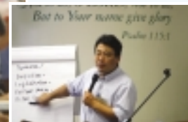
During the plenary sessions guest speakers spoke on worldview, community development, and cross-cultural training. These topics are an integral part of each Lifewater project trip.