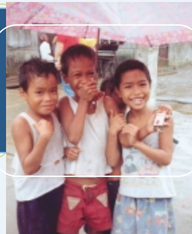
Southeast Asian kids enjoy a downpour during the rainy season.