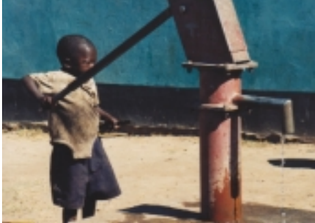
Repairing hand pumps on wells such as this one in Zambia greatly reduces the number of children dying from unclean water.

Lifewater's hand pump repair program has continued to provide clean water to thousands of villagers – with each repaired pump serving between 200 and 400 people. Five national hand pump repair crews were trained in 2003. Each trained team was outfitted with the tools and spare parts to keep working. One of the most successful pump repair training trips this year took place in Zambia. Lifewater trained a group of 16 young people from a church in California, who in turn, trained two Zambian crews. During the training, eight village hand pumps were repaired in eight days! Francis, our overseas partner, has started a church in the community where the training took place. They plan to teach hygiene lessons in partnership with pump repair in 2004.