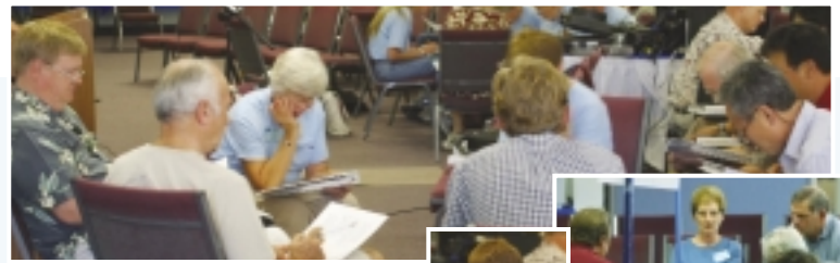
Team huddles brought the volunteers together to plan the project trips for 2004. Seasoned team leaders and the Lifewater Volunteer Handbook facilitated the planning sessions.

The conference is a busy 5-day event filled with technical workshops, trip reports from volunteers who've traveled in the previous year, and project planning sessions. This year, Lifewater is offering 38 trip opportunities to volunteers qualifying to work on overseas projects in 2004. The geographic range of partner countries spans from Central and South America, to Africa and Asia. From our efforts at the conference, project planning is underway for 27 overseas volunteers trips scheduled for the latter part of 2003 and 2004.