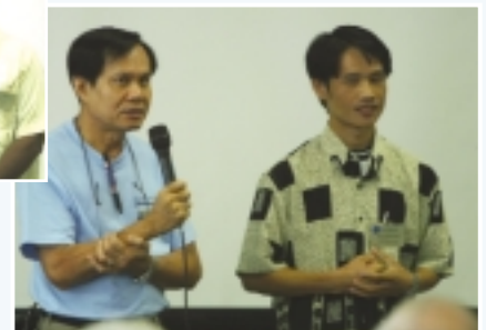
Many Lifewater overseas partners came as guests to bring insight about the water conditions in their regions and the need for more help. This helped the volunteers see the bigger picture and the urgent need.