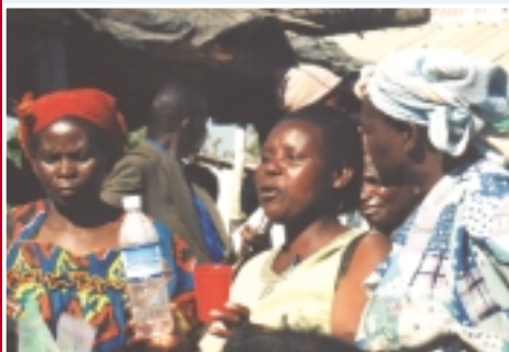
A hygiene lesson called Oral Rehydration Solution is a simple way to keep children from getting dehydrated and dying when struck with dysentery. Mothers everywhere feel empowered by this life-saving knowledge.