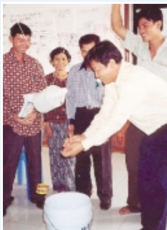
A contraption called a Tippy Tap efficiently uses precious water to wash hands in remote areas.

Lifewater has also had a successful year with its drill training and pump repair programs. In 2003, twelve overseas crews (about 100 people) received introductory or advanced training in shallow well drilling. In Uganda, the drilling crew trained in 1992 continues to bring the life-giving water to refugees and people displaced by war and fighting. These drillers are committed to sharing the gospel at every opportunity to bring eternal hope to the oppressed. In Southeast Asia,